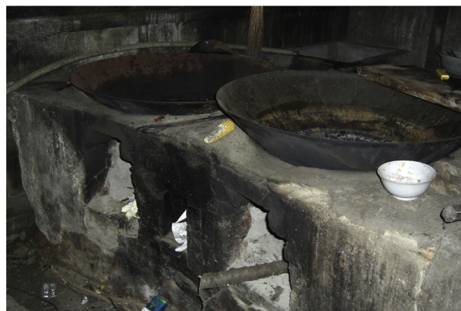
Fig. 1. Example of a traditional biomass stove often seen in rural households in Guizhou, China.

In a subsample of households (110 in winter and 117 in summer), measurements of indoor concentrations of \text{PM}_{2.5} were carried out for 48 h using the particle and temperature monitor UCB-PATS (Edwards et al., 2006). The monitor has been used in multiple studies in developing countries (Armendariz et al., 2008; Chowdhury et al., 2007). The monitors were placed in the kitchen and living room. Details about the study on air pollution measurements are reported elsewhere (Alnes et al., 2013).