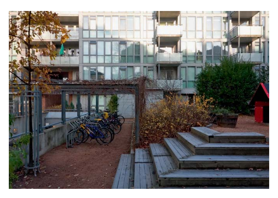
Fig. 3.1 Klosterenga facade seen from the garden. Note: Photo by GASA Architects

Klosterenga is an Ecological Housing Cooperative that stands out in its surroundings due to its facade and modern appearance in an area of old apartment buildings from early twentieth century (see Fig. 3.1).