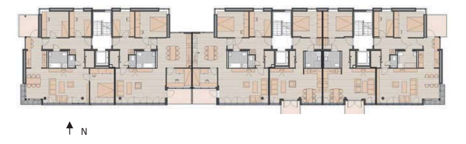
Fig. 3.2 Typical floor plan and section at Klosterenga. Note: Drawings by GASA Architects

The low-energy apartment building provides 35 two-, three- or four-room apartments sized 53–100 m², all planned with a focus on ecological efforts. The floor plan can be seen in Fig. 3.2. The orientation of the floor plan was according to zoning principles. The living rooms face the south window façade, benefitting from sunlight and natural warmth, while bedrooms face the north with a natural airing brick-wall. Bathrooms constitute a heated core in the middle. Klosterenga is designed with a focus on involving residents. Heating (passive and active solar heat and electricity) and ventilation (window airing and balanced ventilation) are regulated by the residents. The double window-façade (see Fig. 3.3) works as