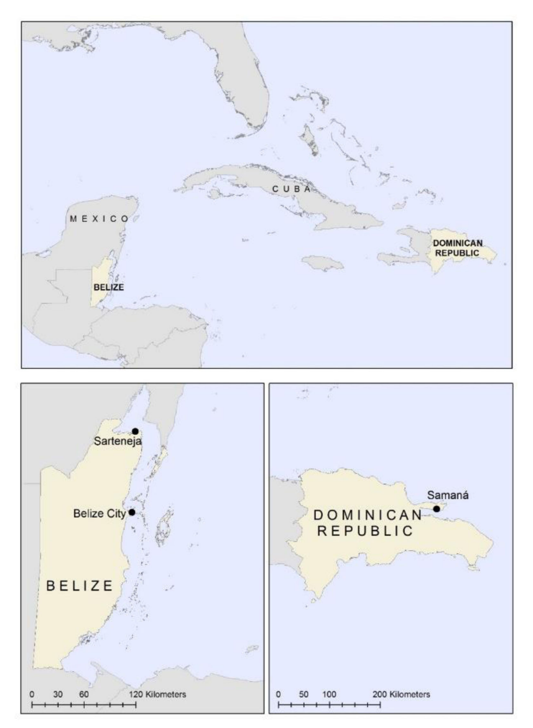
Figure 1. Map outlining Belize and the D.R., and the locations of the case study communities.