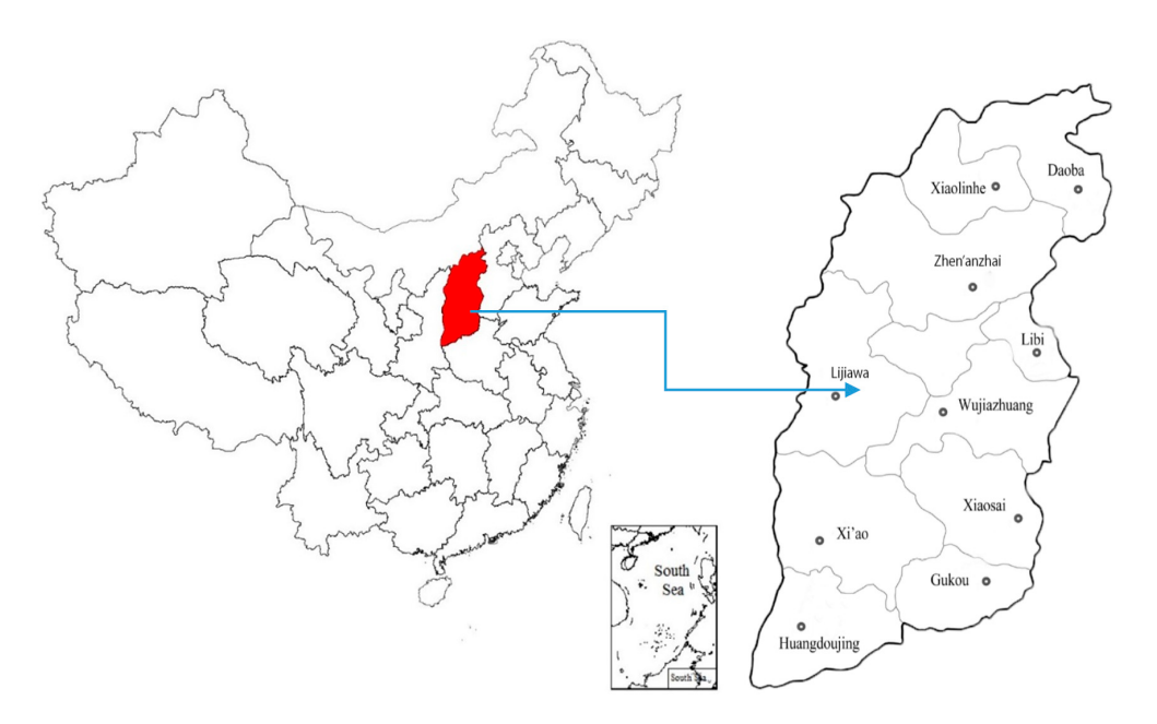
Figure 1. Distribution of the ten villages in Shanxi province of China.