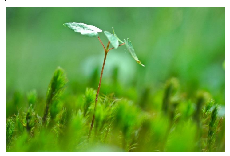
Best practice in green bonds.

CICERO has produced over 60 second opinions since 2008, of which around 20 have received a Shade of Green. Approximately half of the opinions produced by CICERO in 2015 were shaded Dark Green. Yet it is worth noting that many of the issuers that request a second opinion from CICERO are those that have some experience in understanding environmental impacts. CICERO's experience in working with issuers has given us insights about the importance of good management for climate risk, the benefits of environmental dialogue, and what best practice can look like.