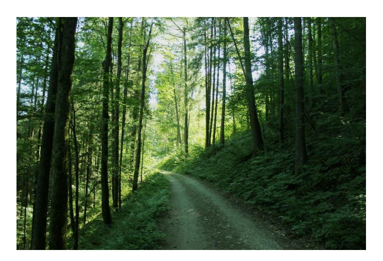
Investors need clear and tailored information on green investments.

Clear and consistent environmental labelling is one tool to help steer investments to a low-carbon and climate-resilient future. Frameworks and procedures for green bonds should become more similar and transparent to increase investor confidence in environmental outcomes. This would help the further development and branding of green bonds as a well-specified financial instrument, reduce transaction costs and facilitate comparison and evaluation across issuers, projects, sectors and technologies.